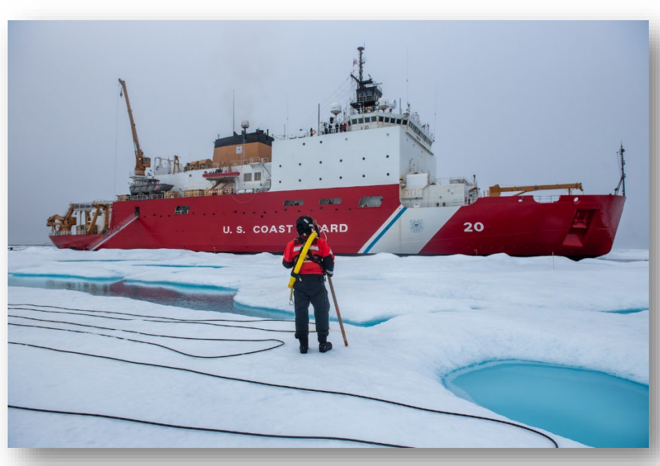
The crew of the CGC Healy, the Coast Guard's only icebreaker specifically designed for Arctic research, works with the Office of Naval Research to place scientific equipment in the Arctic Ocean Basin.