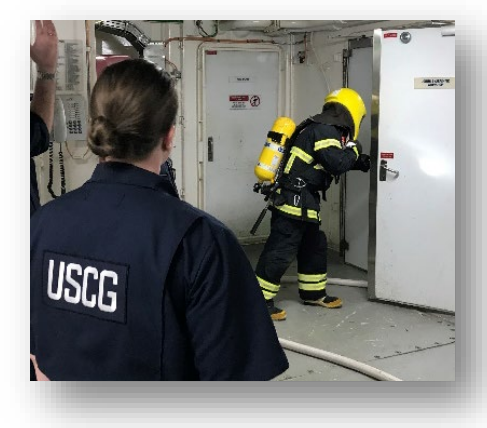
A Coast Guard inspector ensures the safe conduct of professional mariners during a safety exam.