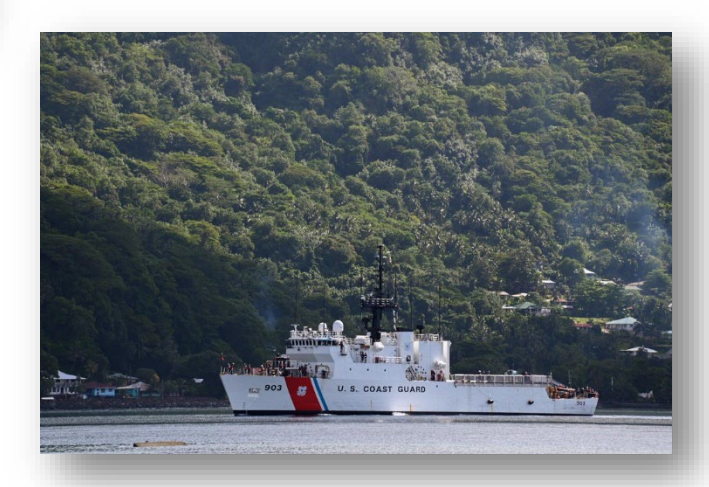
Indo-Pacific Support Cutter CGC Harriet Lane arrives in American Samoa.

The Service is steadfast in our commitment to ensure the Service has the capable, modern assets its workforce needs to meet the unprecedented growth in demand for Coast Guard services. The Service is making critical investments in the Offshore Patrol Cutter, Waterways Commerce Cutter (WCC), and the MH-60T fleet, and furthering C5ISR capability. Additionally, as the Service deploys larger and more capable assets, resilient recapitalization projects, such as piers and waterside support facilities, are vital to mission success.