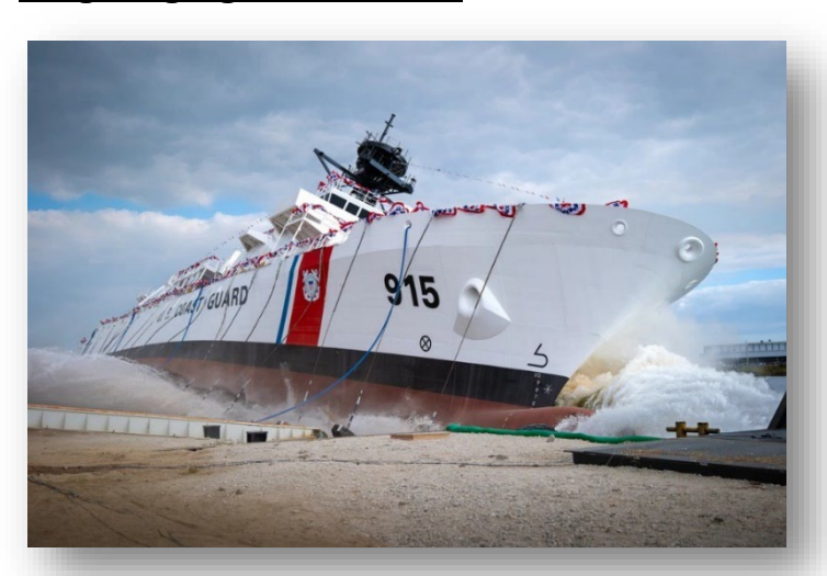
The first Offshore Patrol Cutter, CGC Argus, launched in 2023.