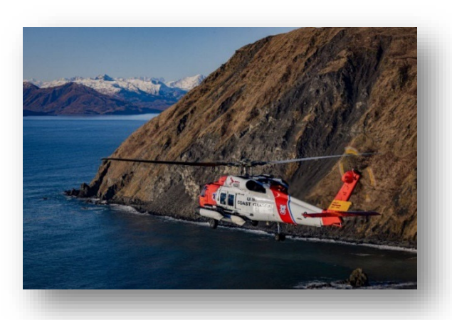
An MH-60T on a mission near Kodiak.