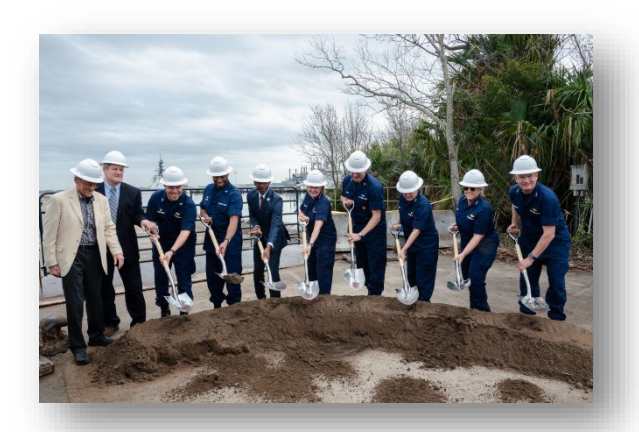
The Coast Guard breaks ground at Base Charleston, the Coast Guard's hub for Atlantic Area operations.

➤ $206 million to recapitalize and sustain fixed and rotary-wing aircraft, including: $168M for sustainment and growth of the MH-60T helicopter fleet; $15M for program management for the HC-130J acquisition; $1M for installation of small unmanned aircraft systems for the National Security Cutter fleet.