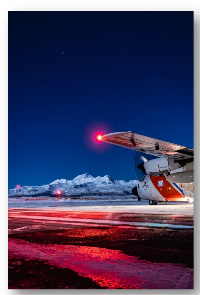
An HC-130 takes off in Alaska.

> $166 million for shore infrastructure improvements to support new acquisitions and the execution of Coast Guard operations, including: infrastructure improvements at Base Charleston, new facility construction at Sector Lower Mississippi River, and Forward Operating Locations in support of the Indo-Pacific Strategy of the United States.